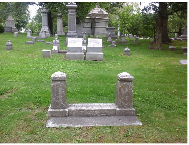
Added by: randal nichoalds